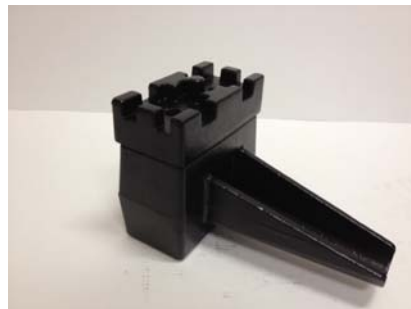
1.5" REAR LIFT OPTION