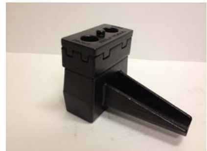
2.0" REAR LIFT OPTION

IMPORTANT! THIS IS A PATENTED, MECHANICALLY-SECURED & INTERLOCKING SYSTEM DESIGNED ONLY TO BE USED ALONE OR WITH THE ORIGINAL OE LEAF SPRING BLOCKS REMOVED FROM THIS VEHICLE.