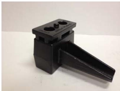
1.0" REAR LIFT OPTION

Step 8: Determine whether you want a 1.0", 1.5" or 2.0" rear lift, and orient the components according to the images shown below to achieve your desired ride height.