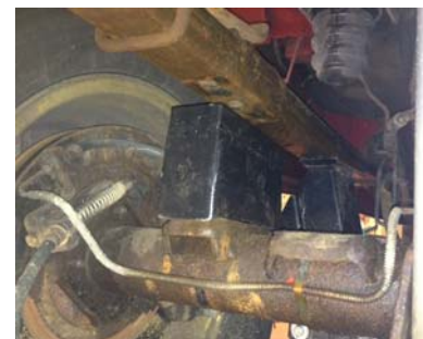
2.0"(2.75") REAR LIFT OPTION

IMPORTANT! THIS IS A PATENT PENDING, INTERLOCKING SYSTEM AND SHOULD NEVER BE STACKED OR USED WITH ANY OTHER LEAF SPRING BLOCKS AS IT MAY CAUSE AN UNSAFE CONDITION FOR BOTH THE INSTALLER & THE VEHICLE DRIVER.